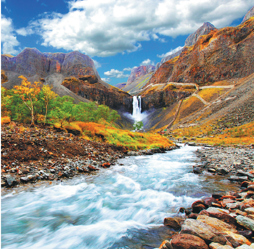
Waterfall at the Changbai Mountains in Jilin province.