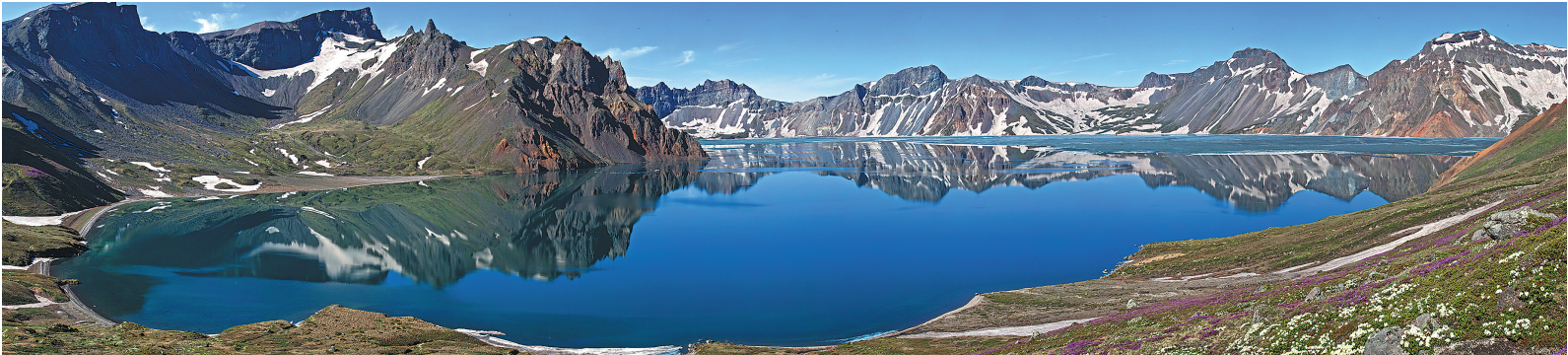
A look at the popular Tianchi Lake at the Changbai Mountains in Jilin.

To date, 45 lakes with a total water reserve of 1 billion cubic meters have been connected, and about 500 sq km of wetland has been recovered.