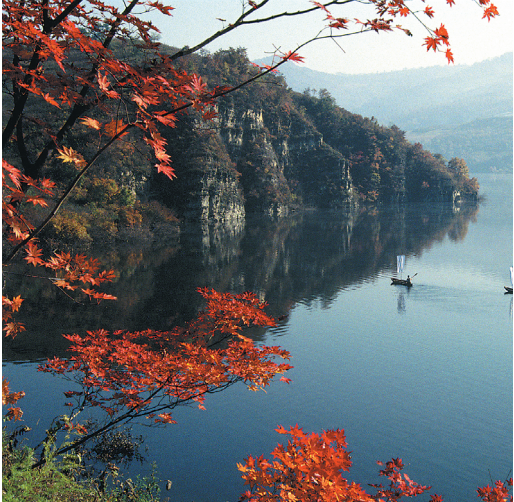
The bank of the Songhua Lake in Jilin.