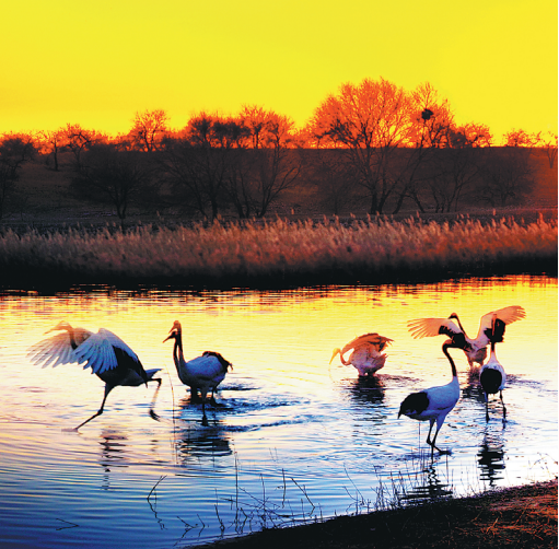
Xianghai Natural Reserve in Baicheng city in Jilin is home to red-crown cranes.