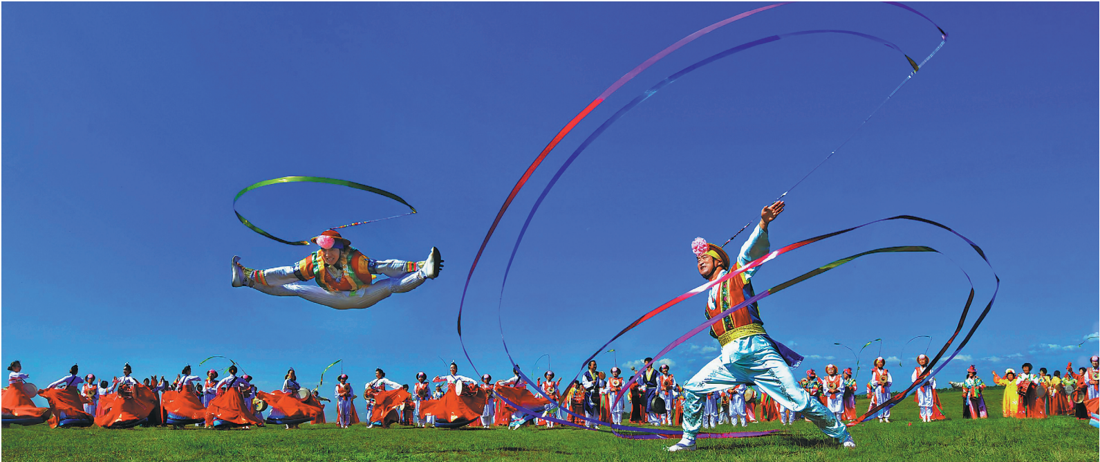
Elephant hat dance is one of the nation's intangible cultural heritages.